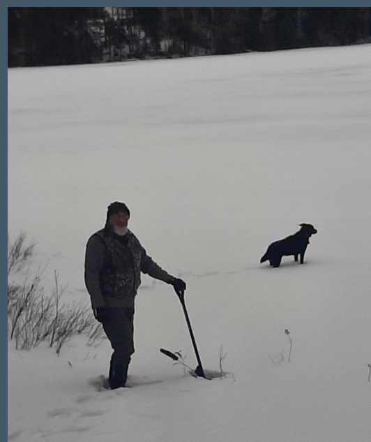
Plenty of ice and snow on the pond this winter.