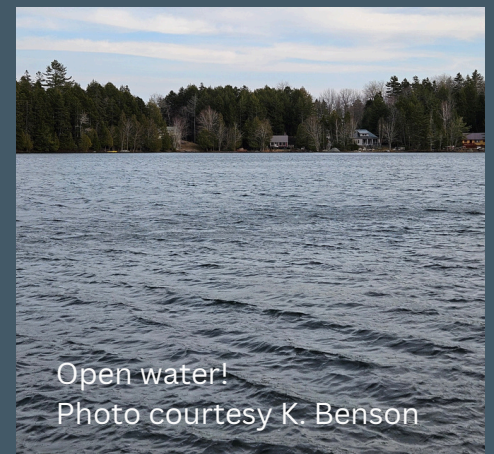
Open water!